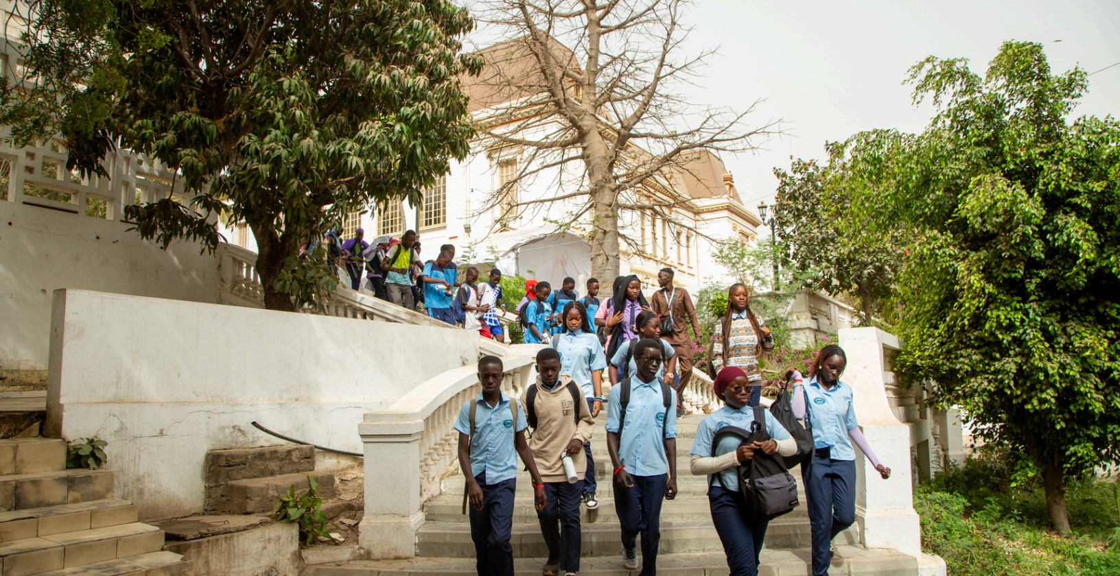
Festival village – Photographer Cheikh Oumar Diallo – FFA2024