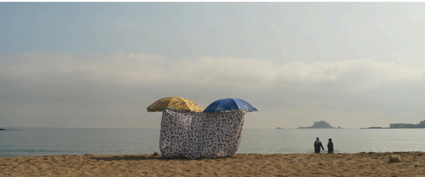
below : Amchilini - by Allamine Kader - FFA2024