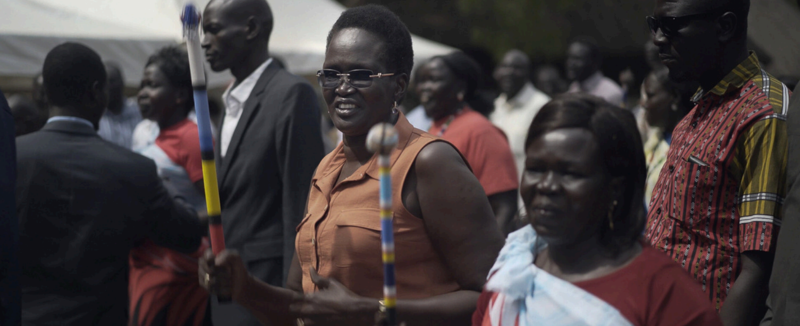
above : No simple way home - by Akuol de Mabior - FFA2024