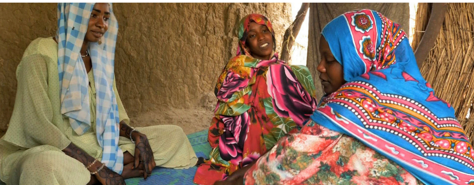
above : La promesse d'Imane - by Nadia Zouaoui- FFA2024