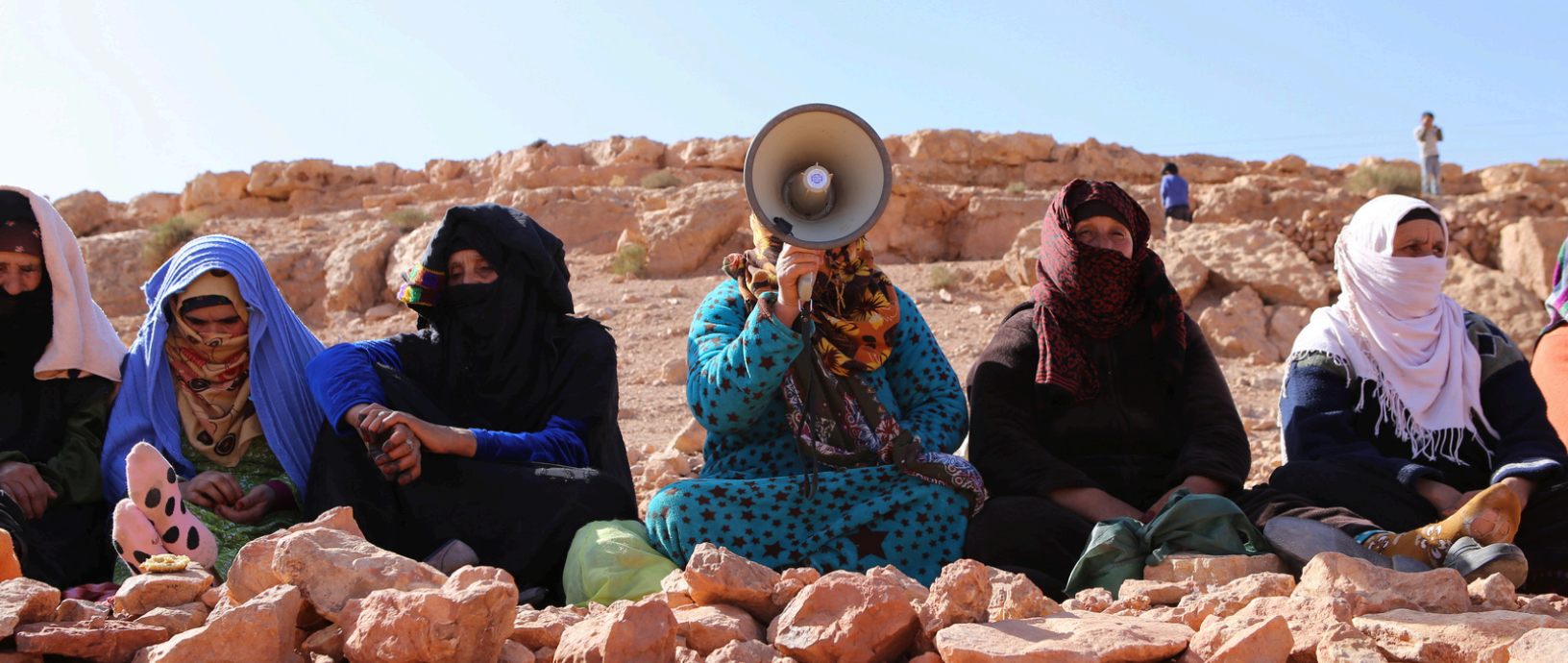
above : Amussu – by Nadir Bouhmouch – FFA2024